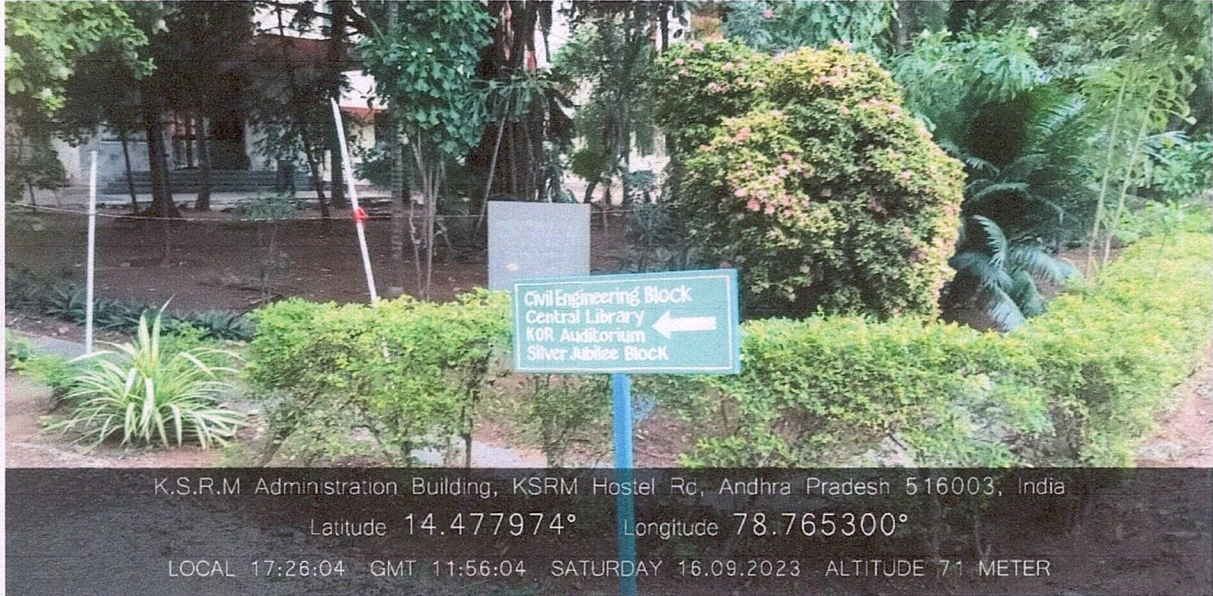
Sign Board showing the Way to Various Blocks/Facilities