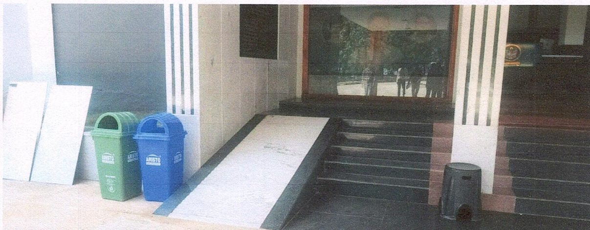
Ramp at Civil Engineering Block

K.S.R.M Administration Building, KSRM Hostel Rd, Andhra Pradesh 516003, India