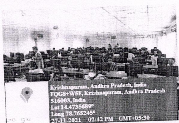
Fig: Students hands on session at Data Base lab