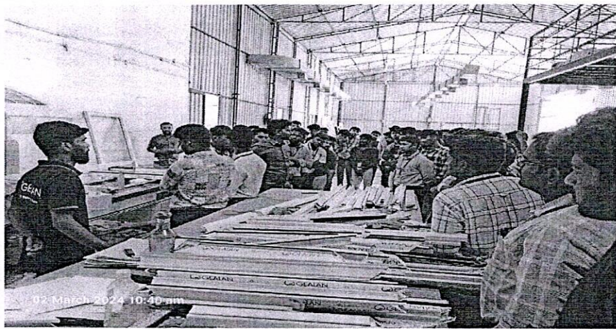
Students at Industry