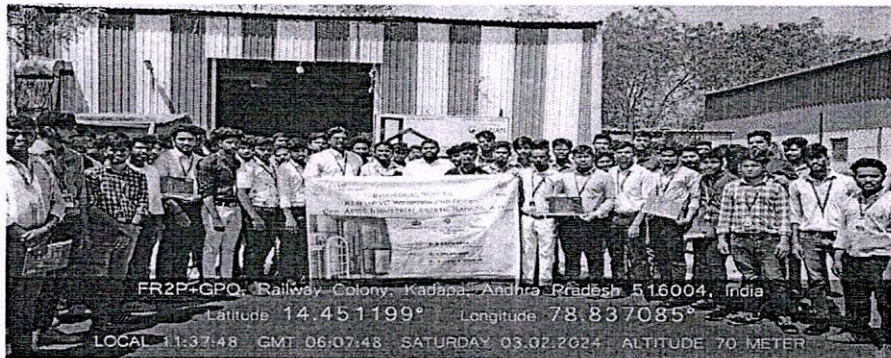
Students Group Photo at Industry