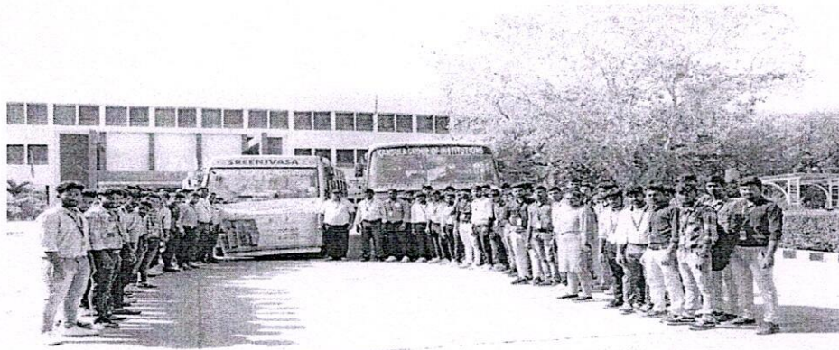
Students Group Photo at College